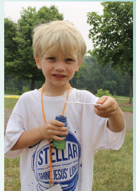
Stellar VBS 2023