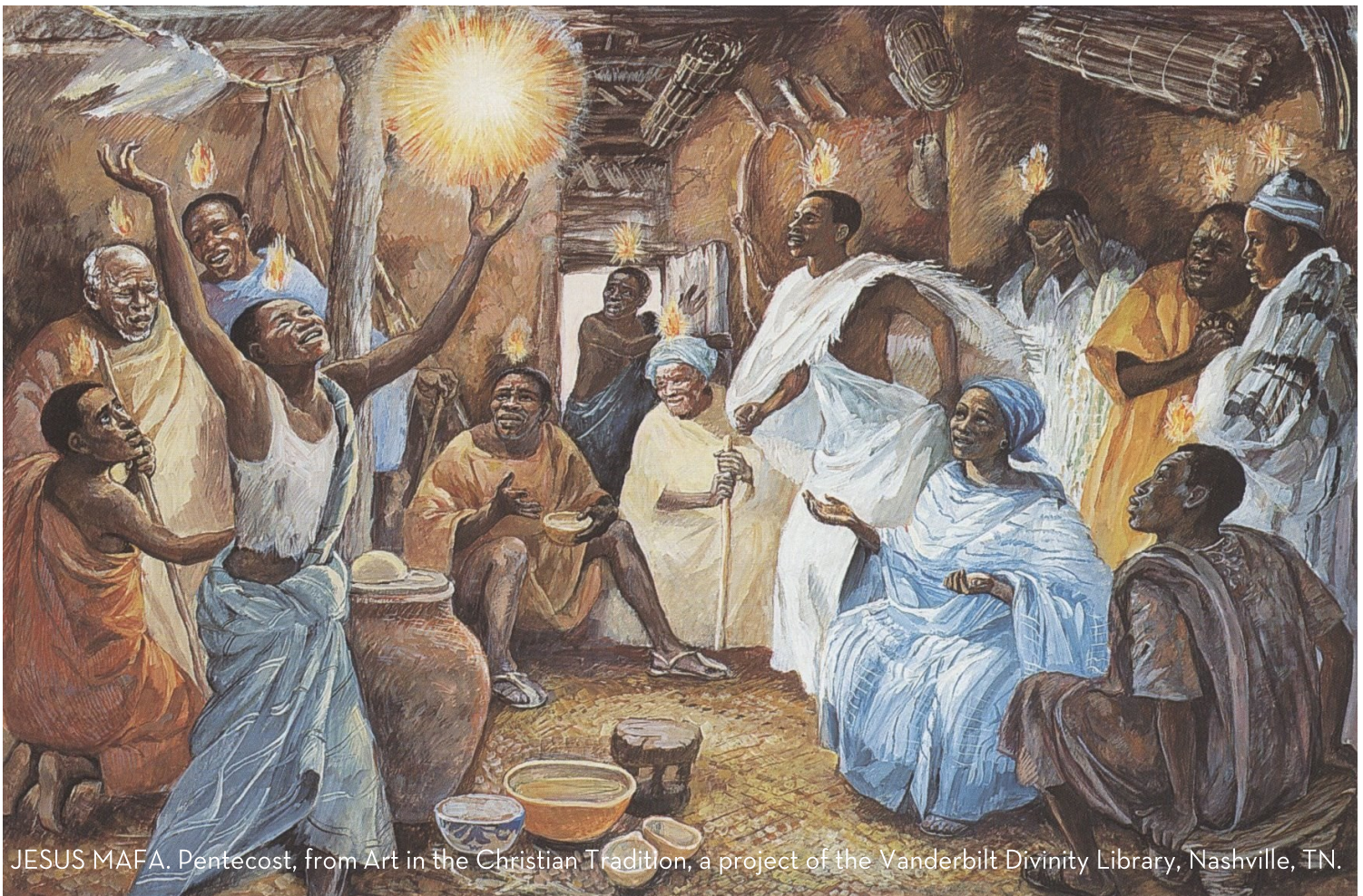
JESUS MAFA. Pentecost, from Art in the Christian Tradition, a project of the Vanderbilt Divinity Library, Nashville, TN.