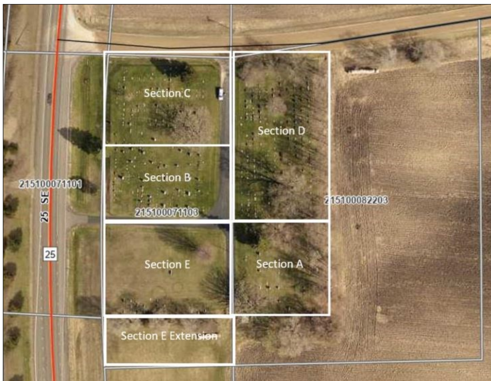
Zion Cemetery with sections and newly purchased land indicated.