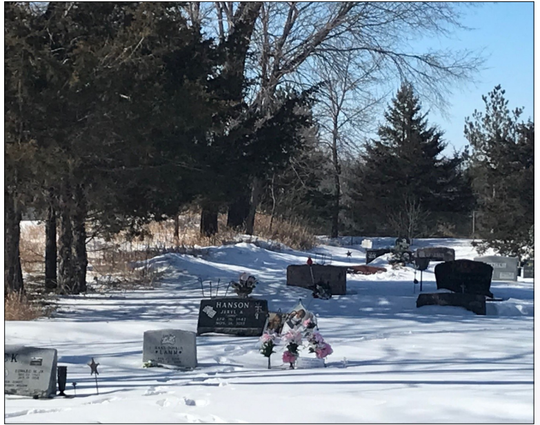
Looking west along the tree line between Section E and the new Section E extension.

Finally, the ground will be smoothed, raked, and seeded for turf grass. The board also discussed extending the decorative fence which runs parallel to Hwy 25 all the way to the new south property line but that project still needs additional research. Finally, the board approved the removal of two large green ash trees located in section D. The trees are near their end of life and have already been dropping large branches.